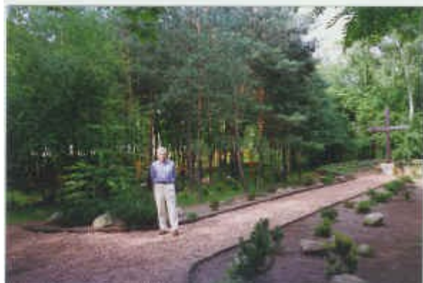
1996 - return trip

Once he was too outspoken in public and reprimanded. He lost his command. But now, this "hell on wheels" general of the Third Army was back, feeling his oats in these private quarters.